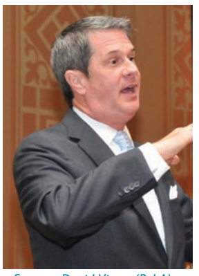
Senator David Vitter (R-LA)