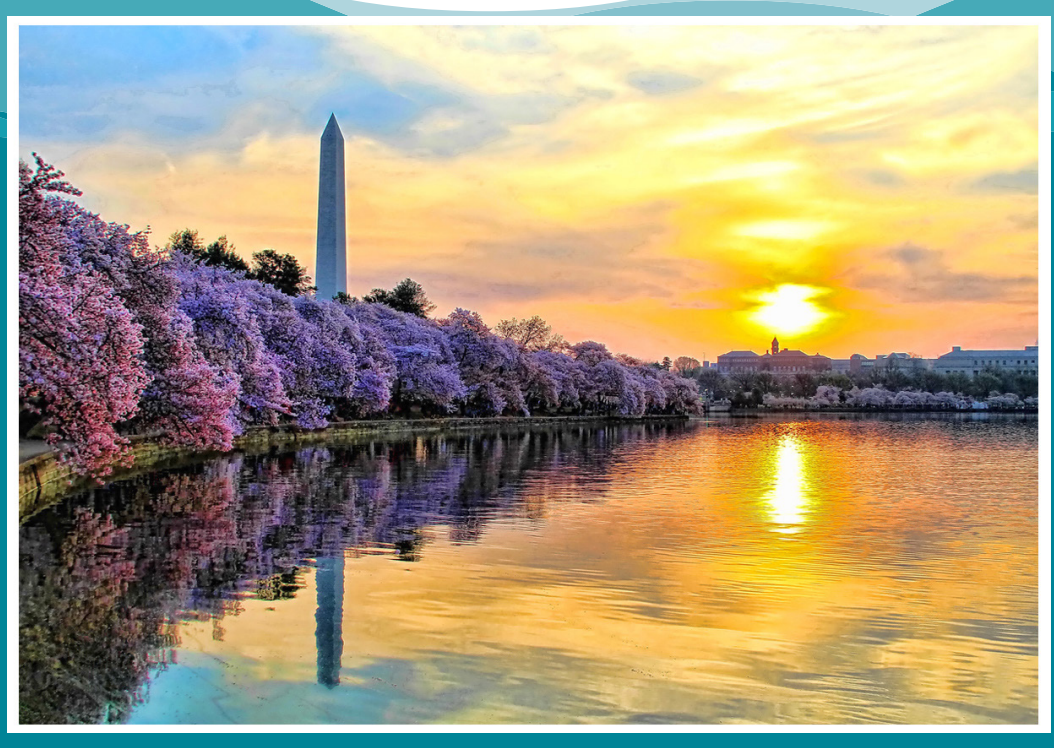
The Ritz-Carlton | Washington, D.C. | April 5-7, 2017