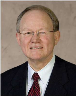
MIKE MCCONNELL SENIOR EXECUTIVE ADVISOR BOOZ ALLEN HAMILTON FORMER DIRECTOR NATIONAL SECURITY AGENCY

Senior Executive Advisor Mike McConnell is the former vice chairman, where his primary roles included serving on the firm's Leadership Team and leading Booz Allen's rapidly expanding cyber business. After retiring from the Navy in 1996 as a vice admiral, Mike joined Booz Allen and led the development of the firm's Information Assurance business and Intelligence business focused on policy, transformation, homeland security, and intelligence analytics, rising to the position of senior vice president.