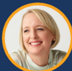
Julie Sweet CEO Accenture, USA