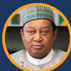
H.E. Mohammad Sanusi Barkindo Secretary General OPEC, Austria