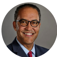
William Hurd, Fmr. Congressman