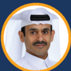
H.E. Saad Sherida Al-Kaabi Minister of State for Energy Affairs Deputy Chair, President, and CEO, Qatar Petroleum, Qatar