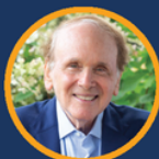
Dr. Daniel Yergin Vice Chairman IHS Markit, USA