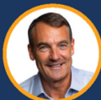
Bernard Looney CEO bp, UK