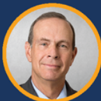
Mike Wirth Chairman and CEO Chevron, USA