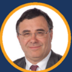
Patrick Pouyanné Chairman and CEO TotalEnergies, France