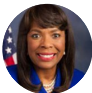
Congresswoman Terri A. Sewell