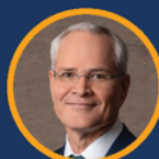
Darren Woods Chairman and CEO Exxon Mobil Corporation, USA