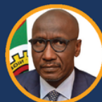
Mele Kolo Kyari Group Managing Director NNPC, Nigeria