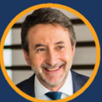
Josu Jon Imaz CEO Repsol, Spain